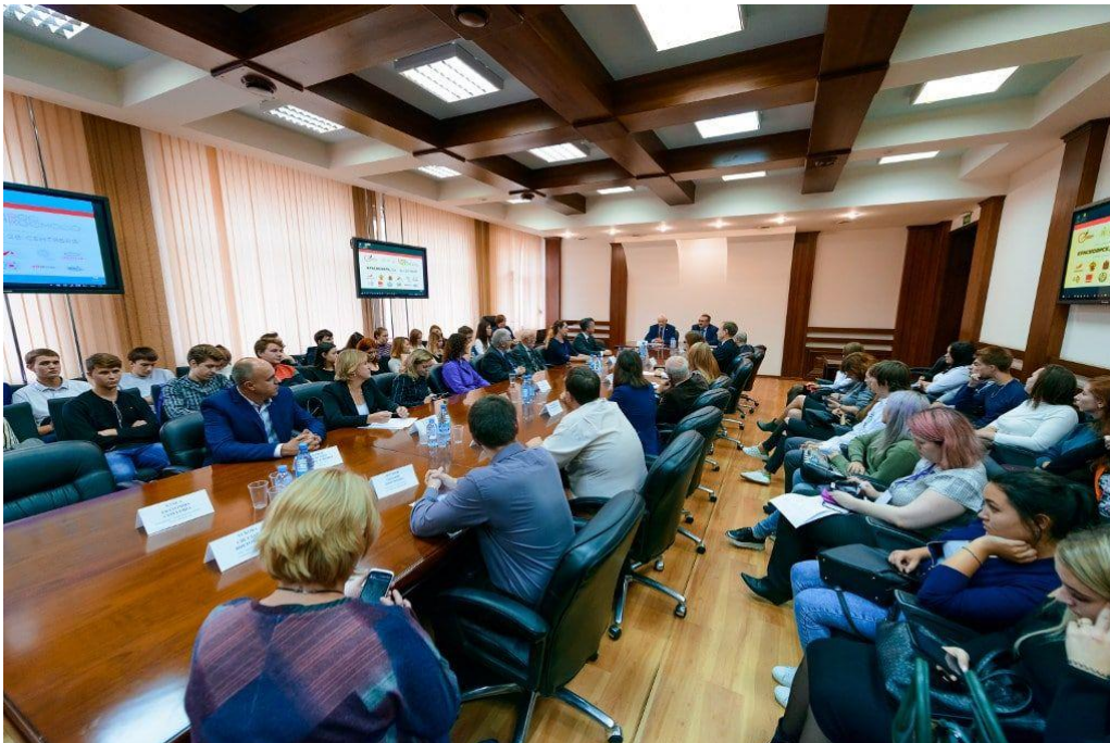
Fig. 2. Discussion of reports and debates in the conference hall.

More than 150 people took part in numerous events online and offline, representing mainly the Krasnoyarsk Krai, as well as other Siberian universities. Specialists and scientists from St. Petersburg and Moscow took an active part. Students from China and Vietnam presented reports in English.