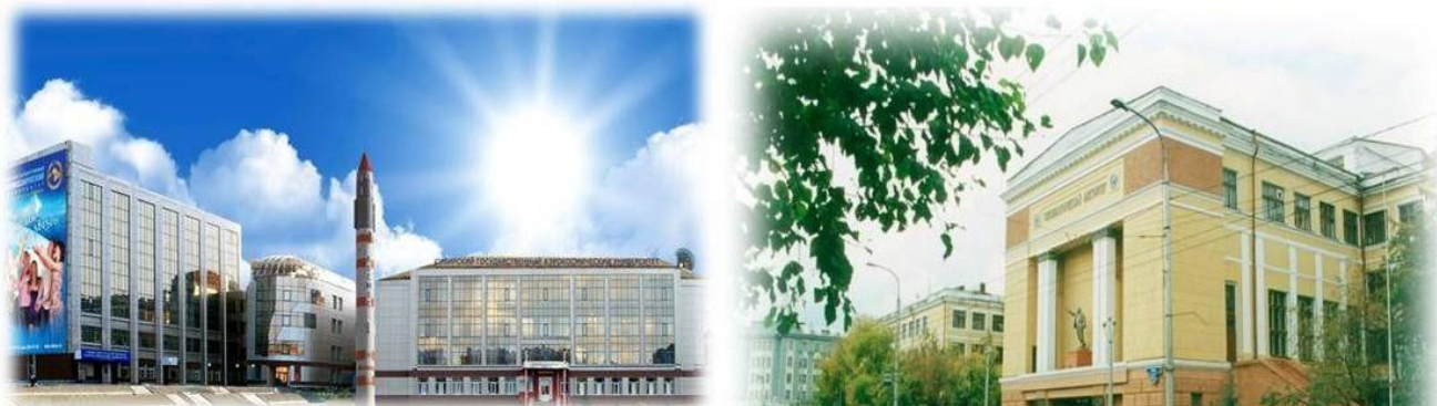
Fig. 1. Siberian State University of Science and Technology named after Academician M. F. Reshetnev.